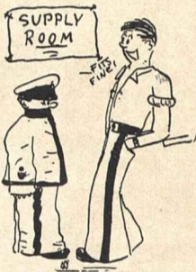
Too Large or Too Small? Which You Want?