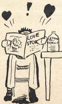
Kaulbach Goes Native