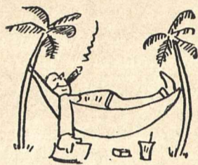
It's the Gypsy in Me